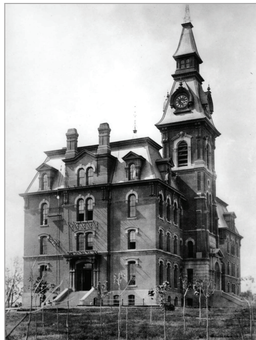
Old Building 1872

Nebraska statehood in 1867 moved the capital city to Lincoln, and the territorial capitol building that had been constructed on the high hill on the western edge of Omaha lost its purpose. By an act of the state legislature in 1869, Omaha acquired the capitol grounds and its buildings for the sole purpose of education. It was first thought that the territorial capitol building would at last provide enduring quarters for Omaha's public school. However, an inspector warned that it was inadequate in both its construction and materials. Accordingly, the old building was torn