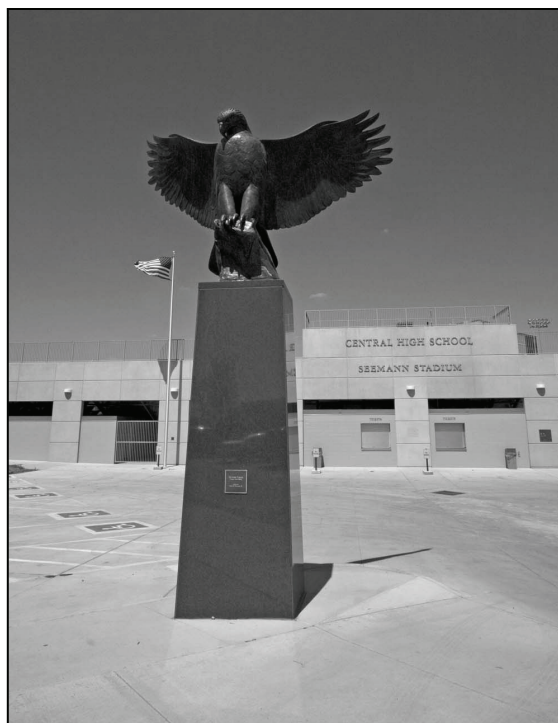
Victory Eagle, a bronze, 1,700-pound sculpture